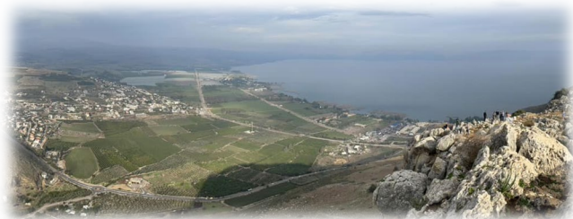
View from Mt Arbel looking over the Sea of Galilee

Begin your day at Mount Arbel for breathtaking views over the Sea of Galilee and time of teaching on the Great Commission.