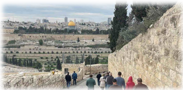
The Palm Sunday Road, Jerusalem

Walk the Palm Sunday Road , retracing Jesus' Triumphal Entry into Jerusalem.