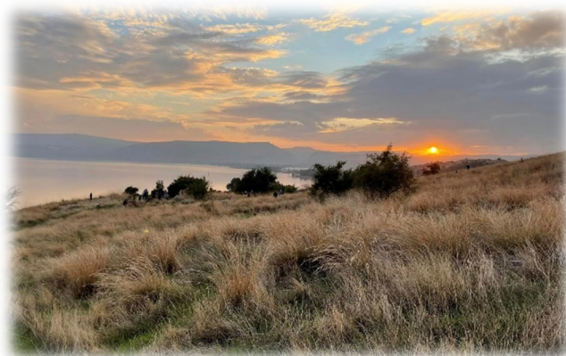
View from the Mt of Beatitudes

famous sermon: the Sermon on the Mount. You will also view the traditional site of Job's Cave .