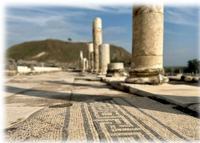
The Cardo at Beit Shean

As you continue along the Jordan Valley you will stop to explore the city of Beit Shean located at the intersection of the Jezeel Valley and the Jordan River . It was an ancient Roman city where King Saul and Jonathan's dead bodies were displayed (1 Samuel 31:8-13). The city contains many well-preserved ruins from different eras and empires including the Egyptians, Byzantines, Greeks, and Romans.