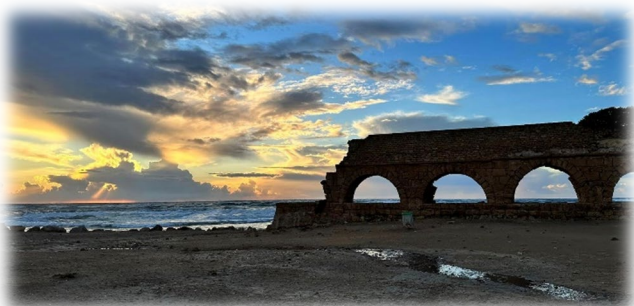
Herodian Aqueduct at Caesarea Maritima

Your tour begins along the Coastal Plain of Sharon to Caesarea Maritima . This maritime city was built by King Herod, and was once the seat of the Roman rule. Here, Cornelius became the first gentile convert. It is also the location where Paul was imprisoned before his trial in Rome. View the ruins of Herod's seaside palace and a large hippodrome where chariot races were conducted.