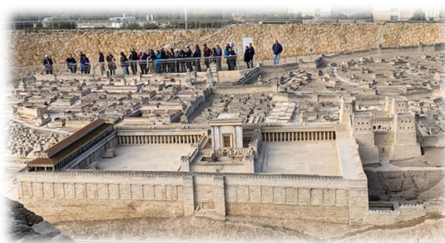
Second Temple model in Jesus' time

Visit and enjoy the Israel Museum, home to the Shrine of the Book , which houses the Dead Sea Scrolls, and explore the miniature scale model of Jerusalem as it appeared in circa 70 A.D.