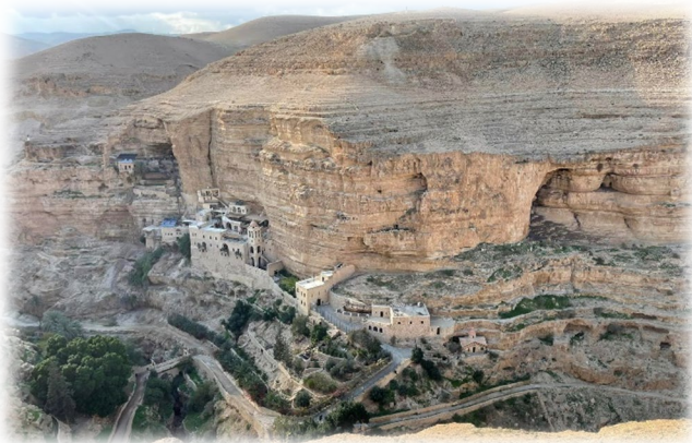
St George Monastery, Wadi Qelt

As you conclude the day, you will ascend up and enter Jerusalem from the north, and gain a spectacular view of the ancient city from Mt Scopus . The place where Roman General Titus camped when he destroyed the city in 70 A.D.