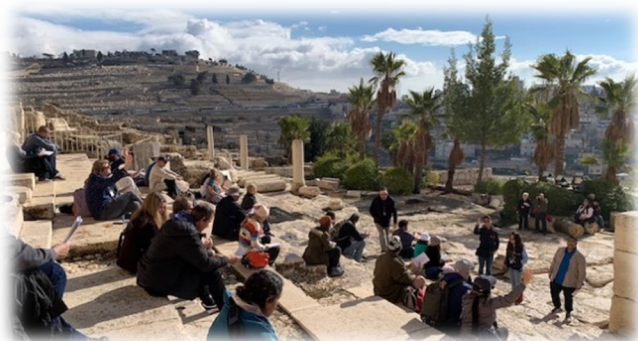
Southern steps with the Mt of Olives in the background

Jesus and His disciples walked and where Peter preached on the Day of Pentecost (Acts 2).