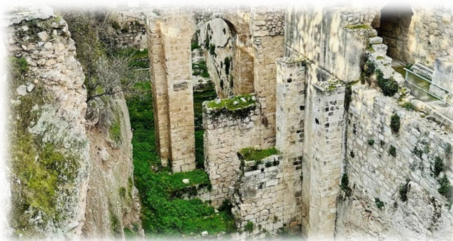
Ruins of the middle porch of the Pool of Bethesda

Visit the Pool of Bethesda (John 5:1-31), where Jesus performed the Sabbath miracle healing of the lame man, and experience the incredible acoustics of St. Anne's Church which dates back to the time of the Crusades.