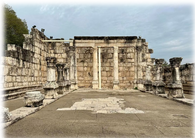
The ancient Capernaum synagogue

Explore Capernaum , the heart of Jesus' ministry, and stand among the ruins of a later synagogue built on the very site of the original 1st-century synagogue where Jesus once taught. Reflect on His teachings and His proclamation of the gospel of the kingdom (Matthew 4:13, 23).