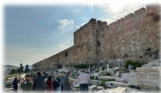
View of Eastern Gate from outside of Temple Mount

From the Temple Mount, gaze at the Eastern Gate , where Jesus will one day make His triumphal entry (Ezekiel 43:1-4). Walk through St. Stephen's Gate , now known as the Lions Gate , traditionally believed to be near the site of Stephen's martyrdom (Acts 7). This is the only gate in the eastern wall of the Old City of Jerusalem.